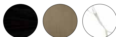
TABLE TOP PORCELAIN CERAMIC LEGS WOOD PAINTED BRONZE BROWN AND BRASS METAL DETAIL