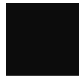
Metal finish Dark nickel

Materials, fabrics, leathers, colors and finishes are approximate and may slightly differ from actual ones. You can find the complete collection of Bonaldo fabrics and leathers on the website <a href="https://bonaldo.biz">https://bonaldo.biz</a>